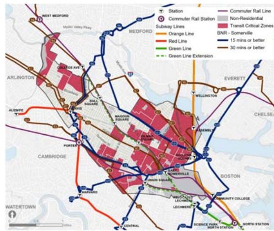
Initial MBTA Planning Scenario